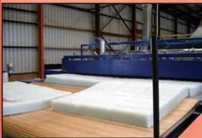
product exiting unit