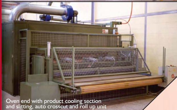
Oven end with product cooling section and slitting, auto crosscut and roll up unit

Introducing “Thermo-Bond” the new CTS/GYSON range of thermal bonding oven lines for the finishing of non-woven natural and synthetic fibre bonded products