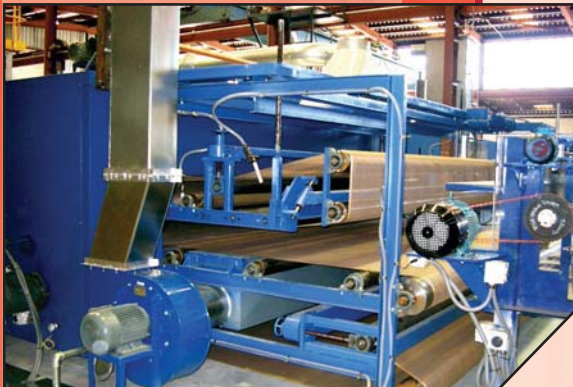
compression exit end